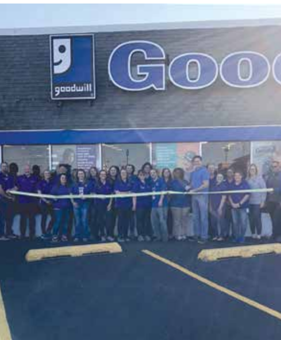
LEFT: Goodwill Litchfield team members cut the ribbon on the new location, October 4, 2019

In 2019 we added to our retail store presence with the addition of a new retail center in Clinton, Illinois and the relocation of our Litchfield store to a larger location with higher traffic count. These additions bring our total retail store presence to 15 in central Illinois and over 400 employees overall in our organization.