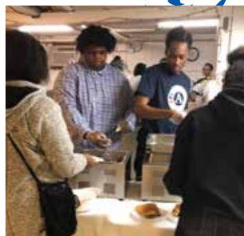
Youth in our program are taught the importance of giving back. Members of the GoodGuides program serve breakfast to over 100 homeless and underserved individuals during Martin Luther King, Jr. Day.

The GoodGuides mentoring program, AmeriCorps, Student Athlete Program and Teen REACH comprise the Youth Services Division who in 2019, served over 100 young people, 15 of whom are currently enrolled in post-secondary education programs.