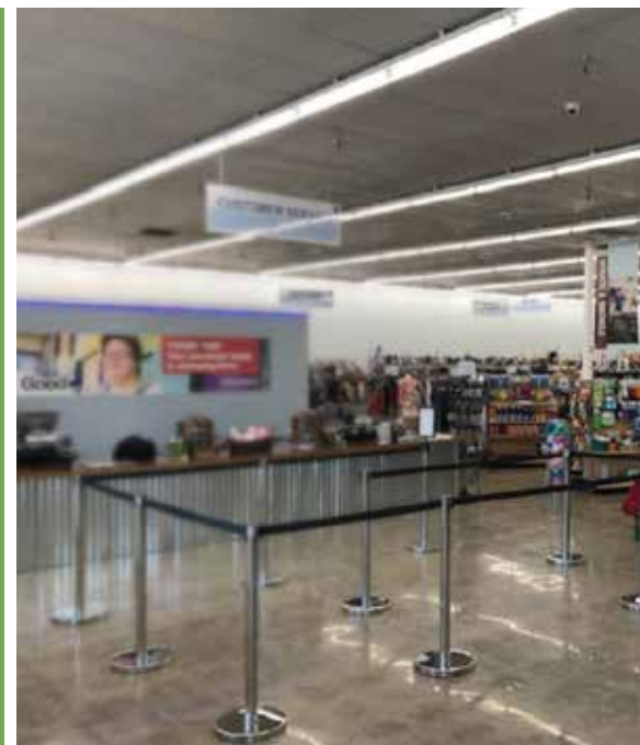
RIGHT: The new Clinton, IL store opened on July 12, 2019