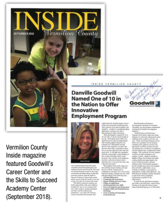
Vermilion County Inside magazine featured Goodwill's Career Center and the Skills to Succeed Academy Center (September 2018).

students, is a new online tool that can build employability skills, self-assessments and allows people to work at their own pace using videos, gaming techniques and real life scenarios. To date, our Career Centers have introduced the program to learners at 22 high schools, community colleges and adult education organizations in central Illinois.